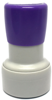
DF26 - Dia 22mm