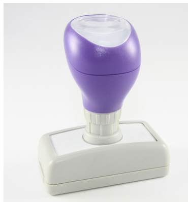
DF1755 - 13 x 51mm