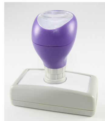
DF3267 - 28 x 63mm