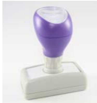
DF1755 - 13 x 51mm