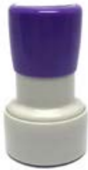
DF26 - Dia 22mm