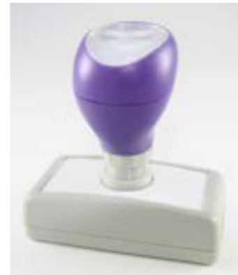
DF3267 - 28 x 63mm